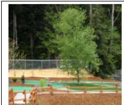
Back of course holes