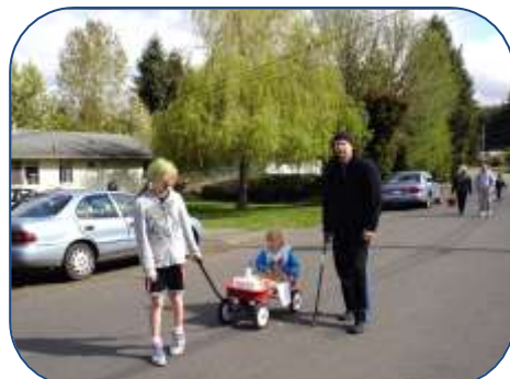
Parade of Earth Day Helpers

Volunteers met at the Play Park on Saturday morning on the 24 th and covered a good portion of Gamblewood – "many hands make light work". We hope for an even greater turnout next year; it is a fun family event!