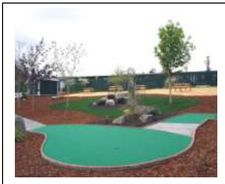
Picnic tables overlooking course to enjoy refreshments and take a break