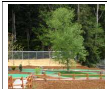
Back of course holes