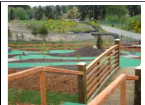
Over the bridge to 'putt on'

We want to know about your own family's milestones.