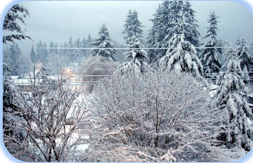
Dawn in Gamblewood after 2008 snow storm

We Wish You Good Fortune and Happiness in the New Year