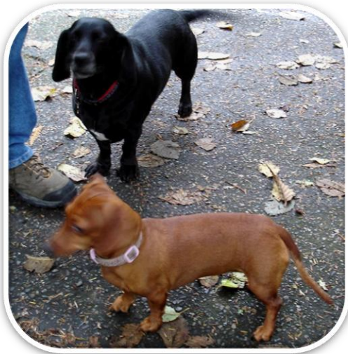
"Sparky", the black lab/dachshund mix and "Mocha", the red dachshund found frolicking in the park.

Send us a picture of your favorite pet and your pet's picture can show up here! Cute and funny photos welcome. Any good bird photos?? Email or send to the board at the address listed below.